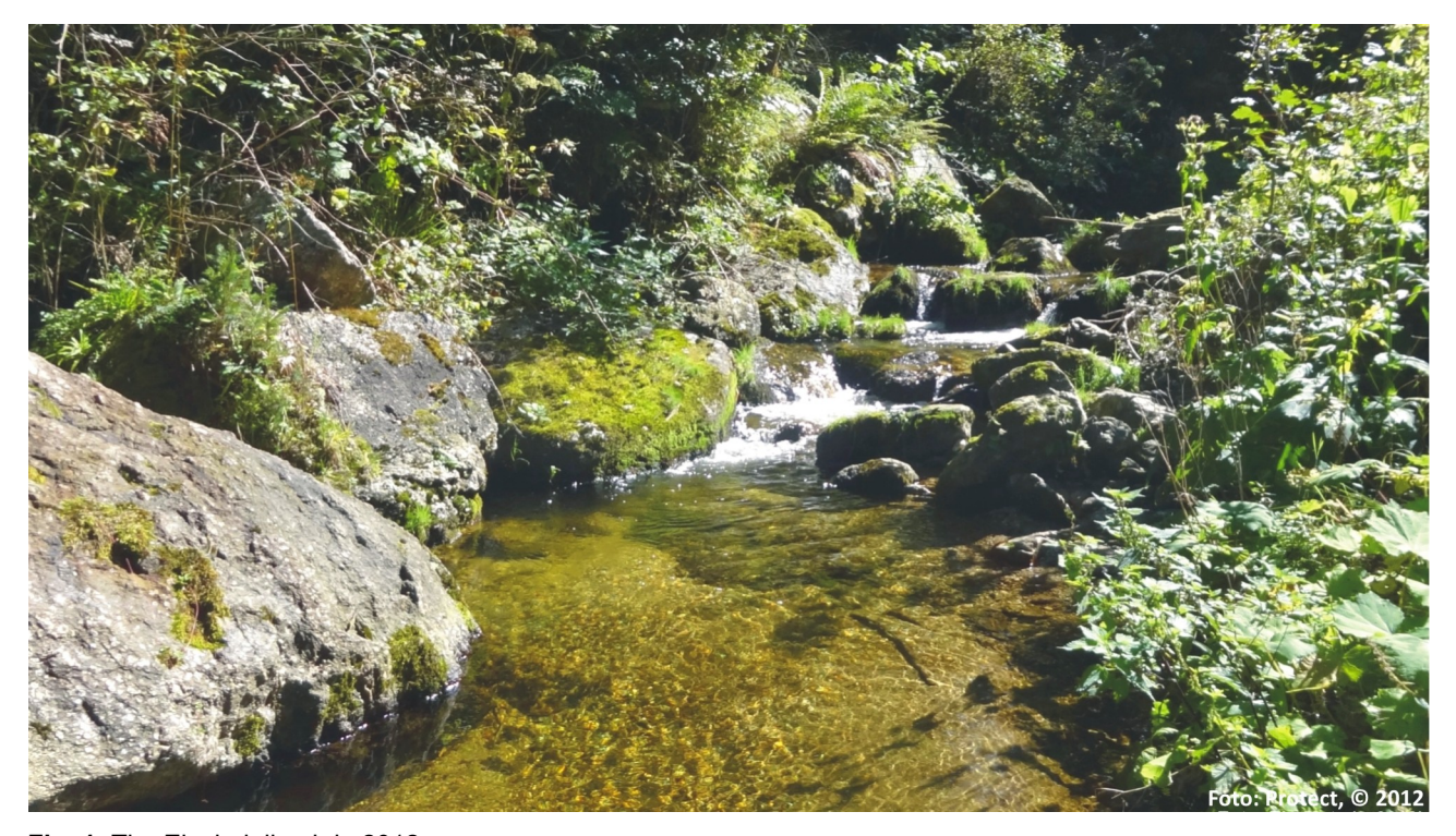
Fig. 1: The Einsiedelbach in 2012.

In 2000, within this area, which is valuable and irreplaceable for many species, the authority granted a temporary permit for a snow-making facility, which was granted again in November 2013 for the expanded state previously made.