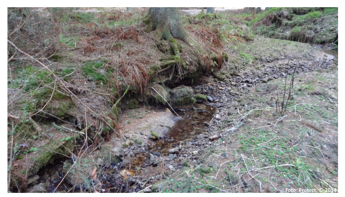
Fig. 3: The Einsiedelbach in January 2014 about 400 m below the point of water abstraction for technical snow-making.

The serious impacts of technical snow-making and sedimentation of running waters on the endangered species, some of which are about to become extinct, have been documented repeatedly in numerous international studies for many years.