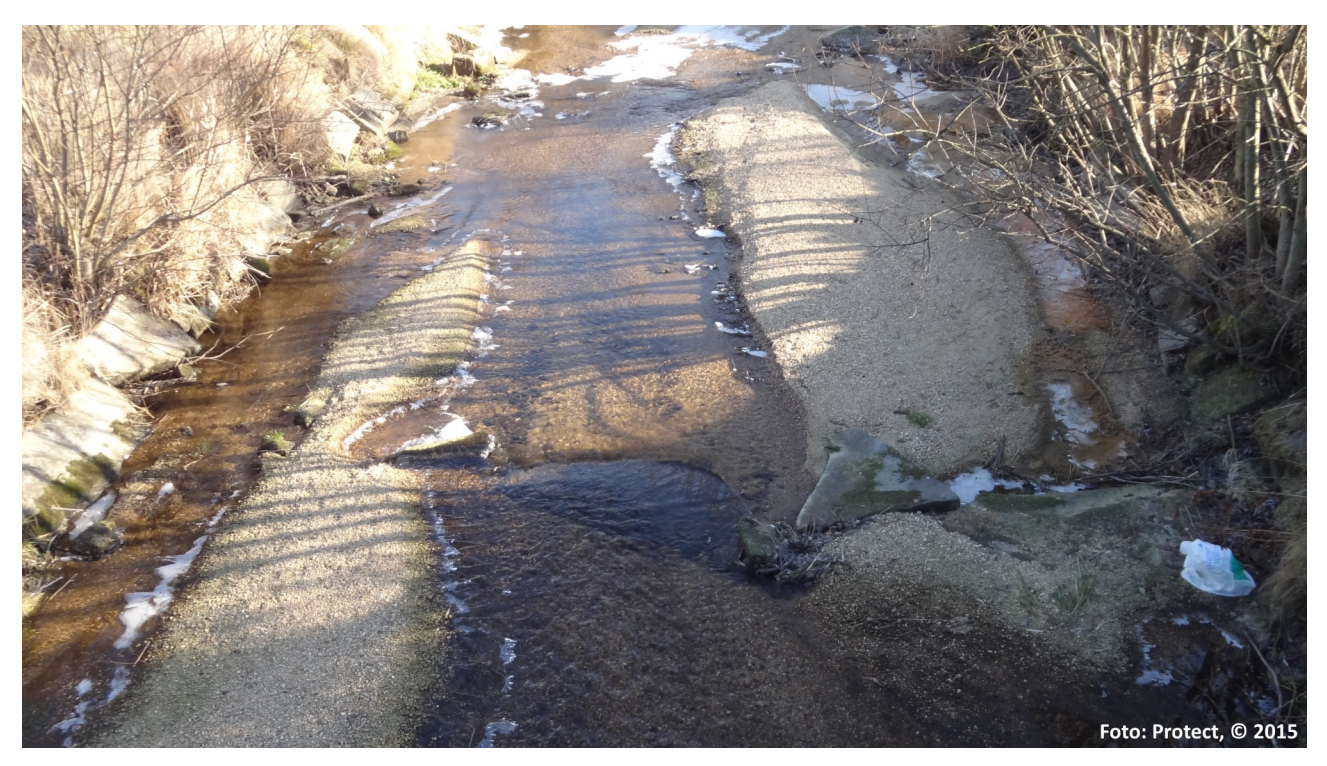
Fig. 2: The sedimented riverbed of the Lainsitz in the municipality of St. Martin in December 2015.

Among other things by erosion of the over-used ski slope, the Einsiedelbach and the Lainsitz (SCI) were sedimented. In sedimented streams, life is largely extinguished by suffocation of the offspring, damage to spawning grounds, reduction of food supply, etc. The feeding habitats of protected birds and the vulnerable riverine species protected in the SCI, such as the freshwater pearl mussel, are seriously affected. The fresh water pearl mussel is threatened with extinction in Austria and has disappeared during the period of operation of the snow-making facility in the mother bed of the Lainsitz.